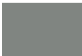
33GR Gray - ANSI No. 61