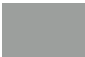
32GR Light Gray